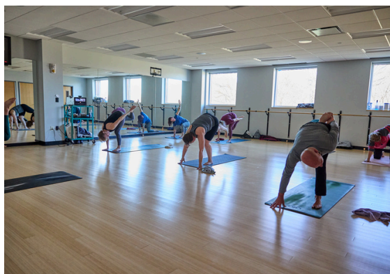
Pictured: Afternoon Yoga on Campus!

*This event is free and is open to students and the public. You MUST register to attend!*