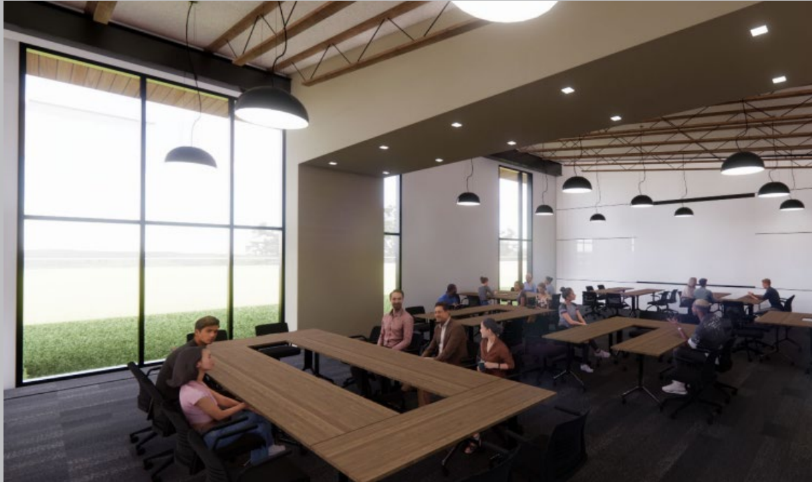
Conference Room (Open Moveable Partition)