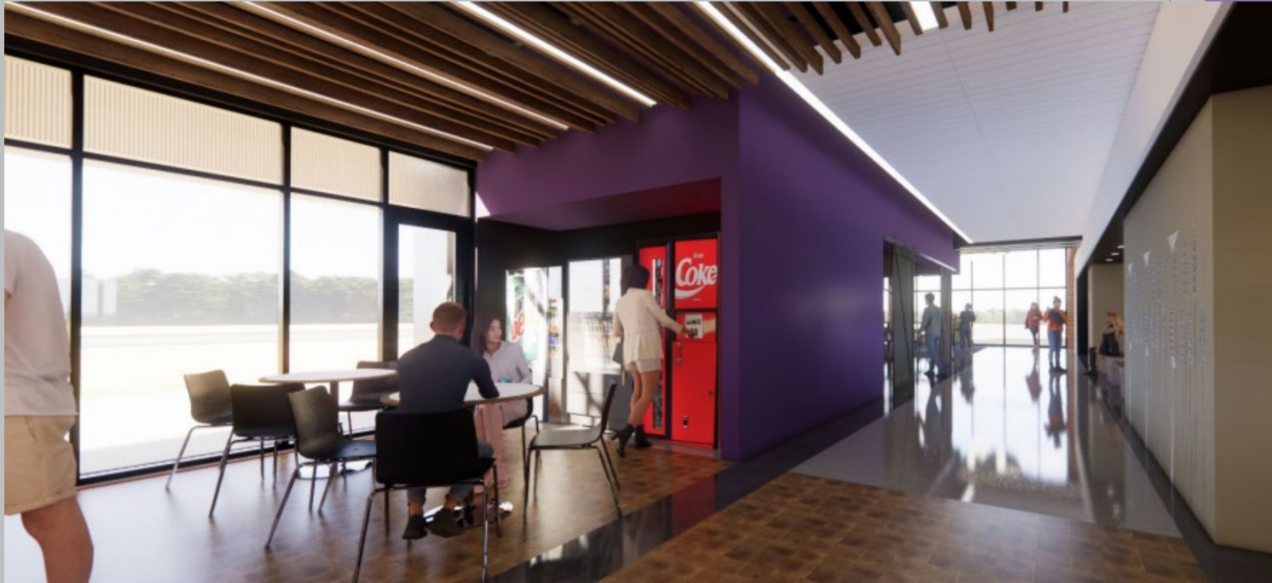
Student Lounge and Donor Wall