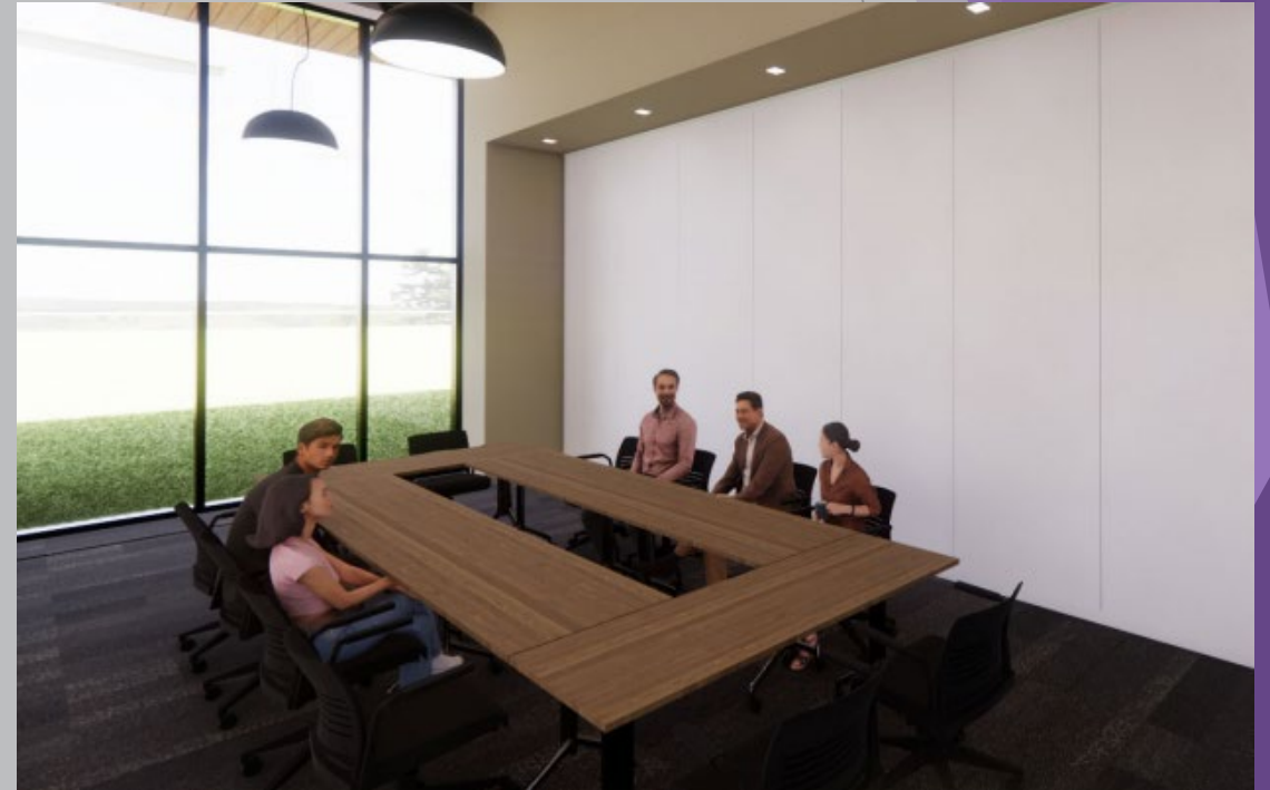
Conference Room (Closed Partition)